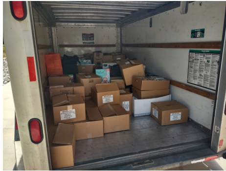
...and in the trailer.