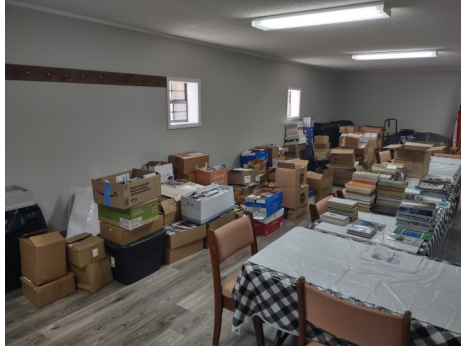
Before loading the trailer. Possibly our largest collection yet.