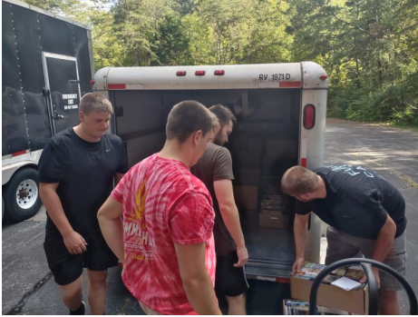
We recruited some help with the loading.