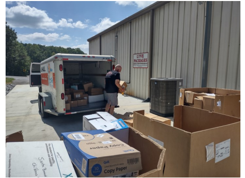
Ready for unloading