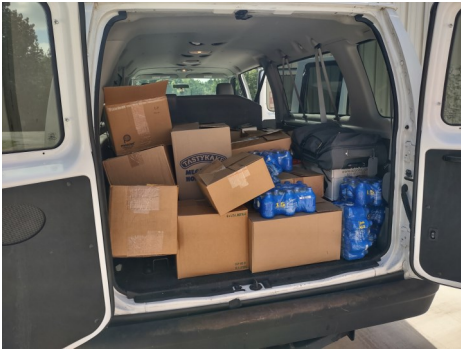
Boxes in the van...