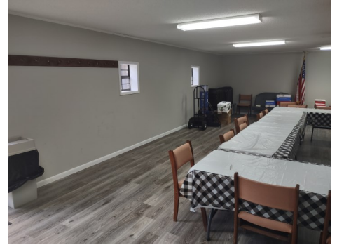
Our office is clean again — and ready for new donations