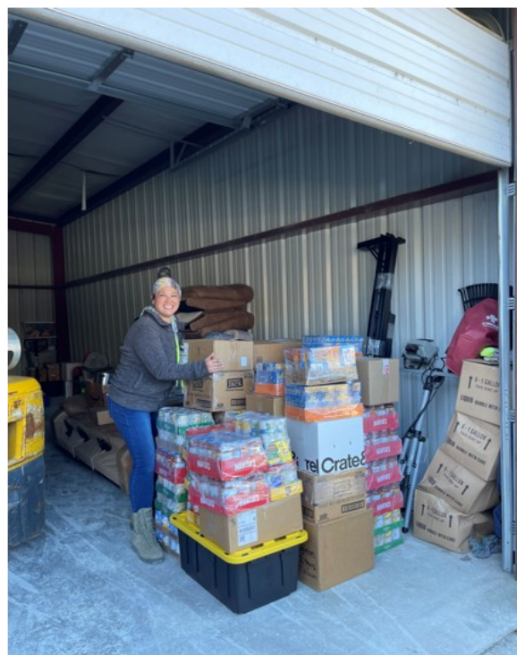
Tornado Relief Delivery to Dresden, TN