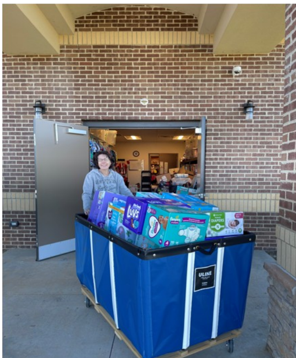
Tornado Relief Delivery to Bowling Green, KY