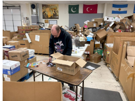
Sorting and packing Christian books and Bibles