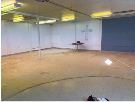
Worship space that needs renovation.