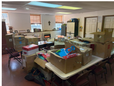
Toys from Central Baptist's Toy Store were taken to Trade, TN.