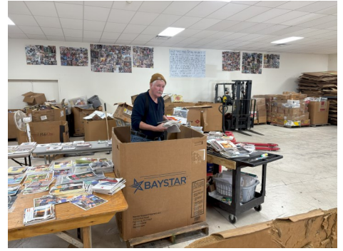
Sometimes you just have to climb in the box.