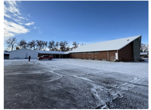
Redeemer Church in Broomfield, CO, shares this building with two other congregations.