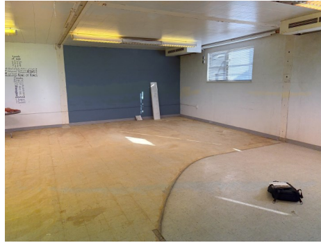
Other half of the worship space