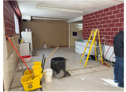
Kitchen area to be remodeled