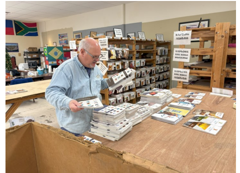
Separating Sunday School quarterlies