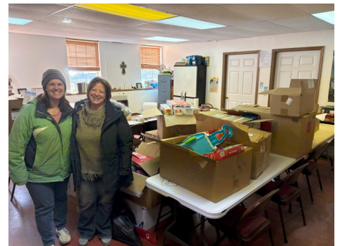
Two members of New Beginnings Church in Trade were excited to receive the donated toys.

Tennessee WMU scholarship information is available here . Applications must be completed by January 25, 2025 .