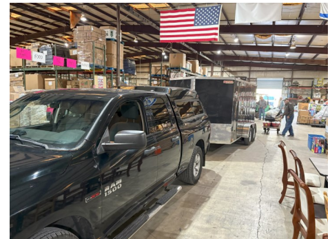
Heading out of the warehouse