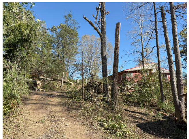
After: There's the house.