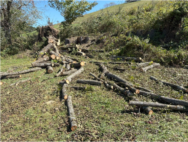
Hickory tree for firewood