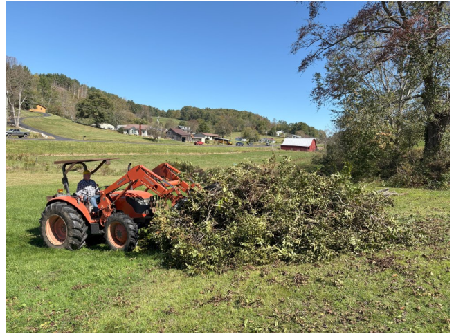
Limbs of the hickory tree