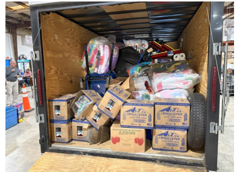
Preparing to unload