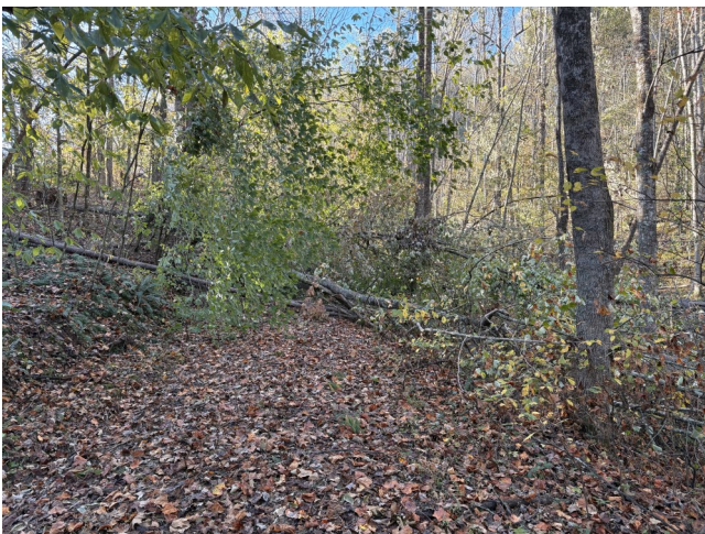
This is someone's driveway.