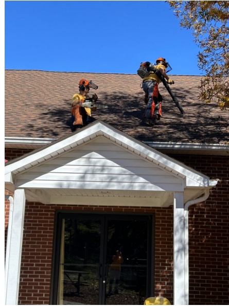
Cleaning off the church's roof.