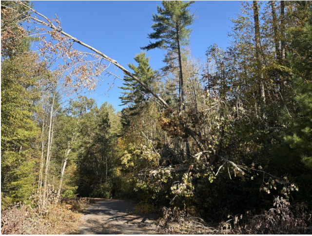
Before: A road half blocked