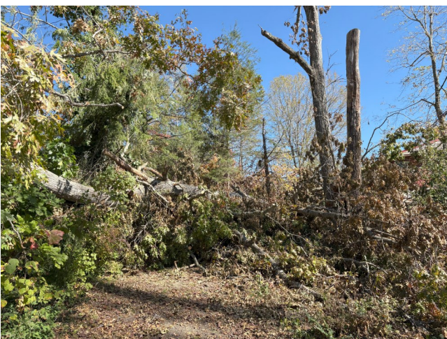
Before: Do you see the house?