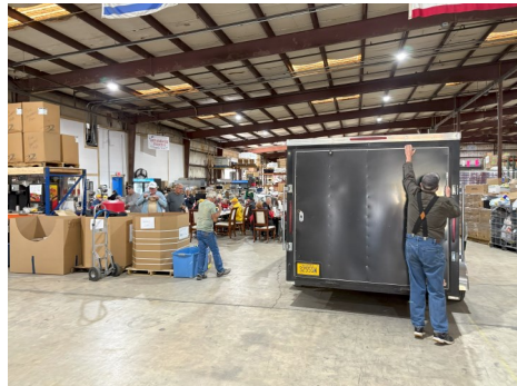
Pulling into God's Warehouse