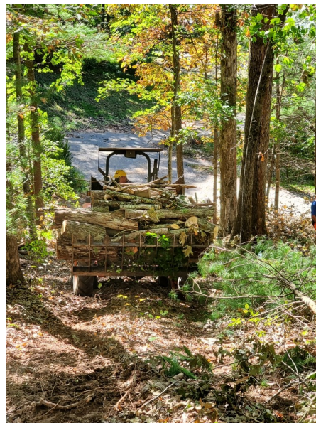
Taking a load 75 yds back down to the road. Arlin Phillips