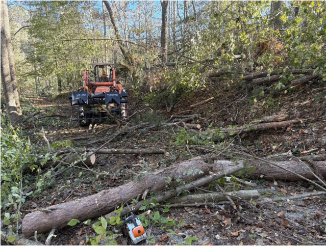
Trees are all dropped. Now the tractor can clear the driveway. Arlin Phillips