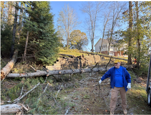
Trees in a back driveway.