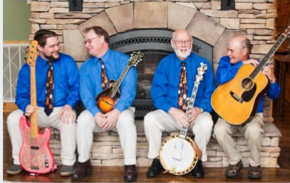
Music by The Bilbreys

Memorial Baptist Church (Monday) May 1, 2023 — 10:30 a.M.