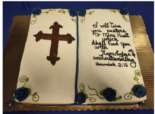
Delicious cake presented for dessert.

A special Thank You to everyone who helped with the Ministers' Appreciation Dinner. The food was delicious, the company was enjoyable, and all around it was a wonderful evening.