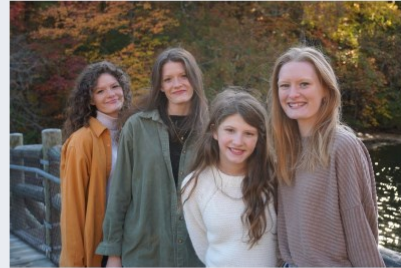
Music by The Perryman Sisters

Bethlehem Baptist Church (Tuesday) May 2, 2023 — 10:30 a.M.