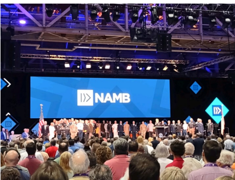
NAMB commissions 79 new board missionaries