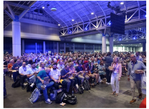
NAMB Luncheon (North American Mission Board)