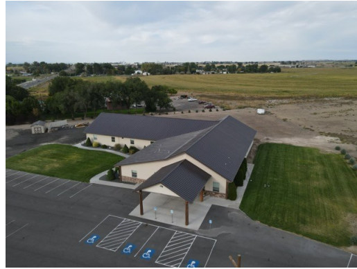
Complete with metal