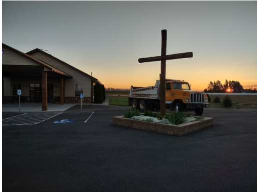
Getting an early start before it heats up in the desert