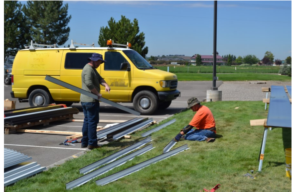
Doug Elders helping to prep the metal