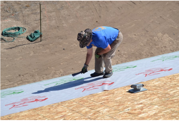
Kirk Casey Laying down synthetic tar paper