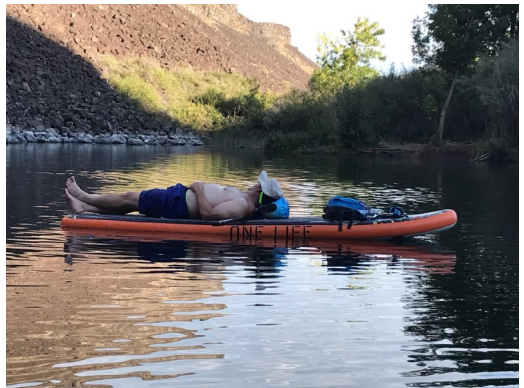
Everyone deserves a relaxing evening after a fall day on a roof.