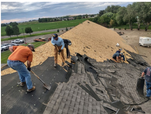
First day with just a few workers. Doug Elders in the orange shirt.