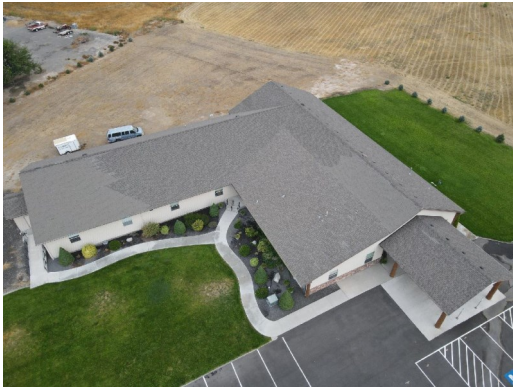
Before with shingles

In August (21-30) we took a team to Jerome, Idaho, to help Northridge Fellowship replace their shingle roof with a new metal one.