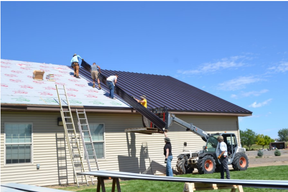
Doug letting go of the metal as Kirk & other volunteers secure it to the roof.