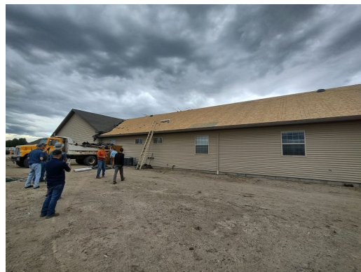
One side completely stripped the first day