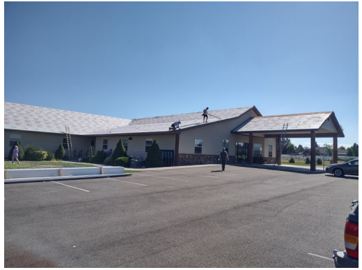
Stripped clean, paper down, and ready for metal