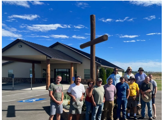
Volunteers from TN and MS helped church members save over $50,000 in labor costs