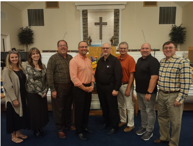
CPBA Leadership Team 2024: L to R

Contact Kirk if you would like to volunteer to go on one of these trips to deliver materials and to help sort and pack them for shipping.