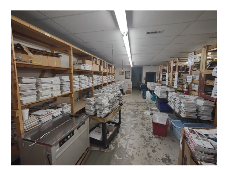
Before packing Sunday School materials