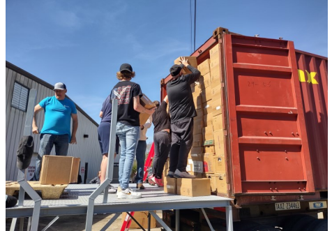
"An empty hole is a lost soul." So fill all the spaces.