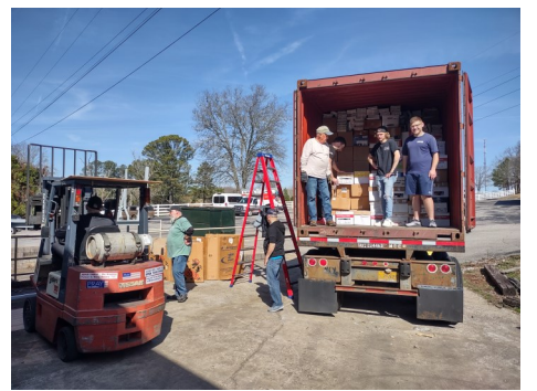
Taking a break.