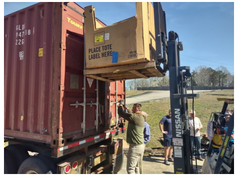
Pushing the container doors closed.