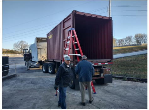
Empty container arrives.