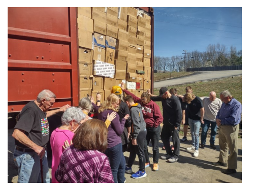
Praying over the container on its way to the Philippines.