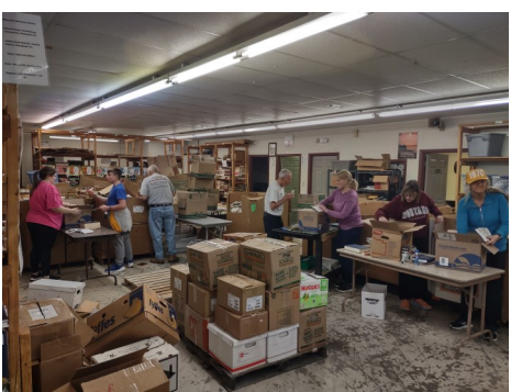
We were joined by a mission team from Houston, TX.