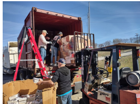
Begin filling the container with literature, Bibles, and books.