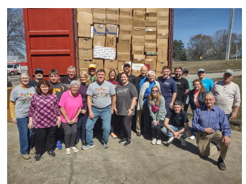
Our group along with a mission team from Houston, TX.