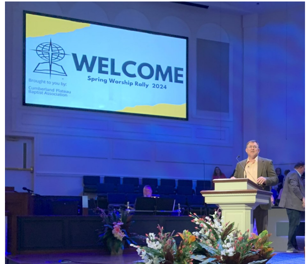
Kirk welcomes everyone